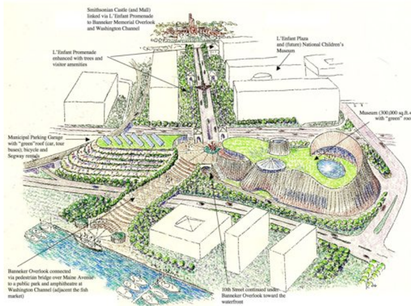
A Practical Solution for 10 th St.-L'Enfant Promenade-Banneker Overlook. See the diagram at http://www.savethemall.org "What does the Mall need," "A practical solution for 10 th Street/L'Enfant Promenade/Southwest Waterfront."

American History and Culture, the Coalition created a vision for that area—an ideal place for Mall expansion—that turned the forlorn, neglected space into a lively destination (see below). Regrettably, the museum chose a site on the Mall and a great opportunity was lost to initiate Mall expansion. But that will come, and the vision for Banneker Overlook remains a realizable concept.